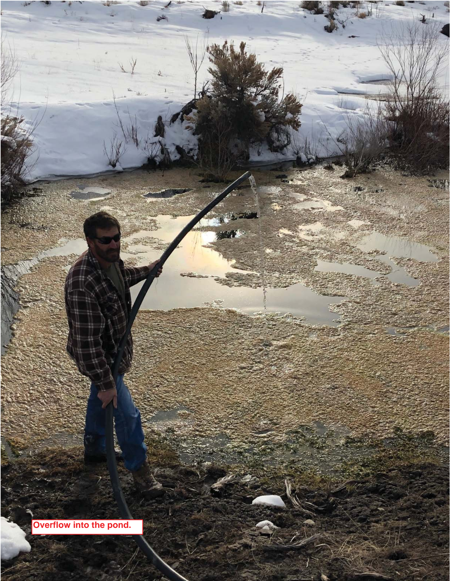
Overflow into the pond.