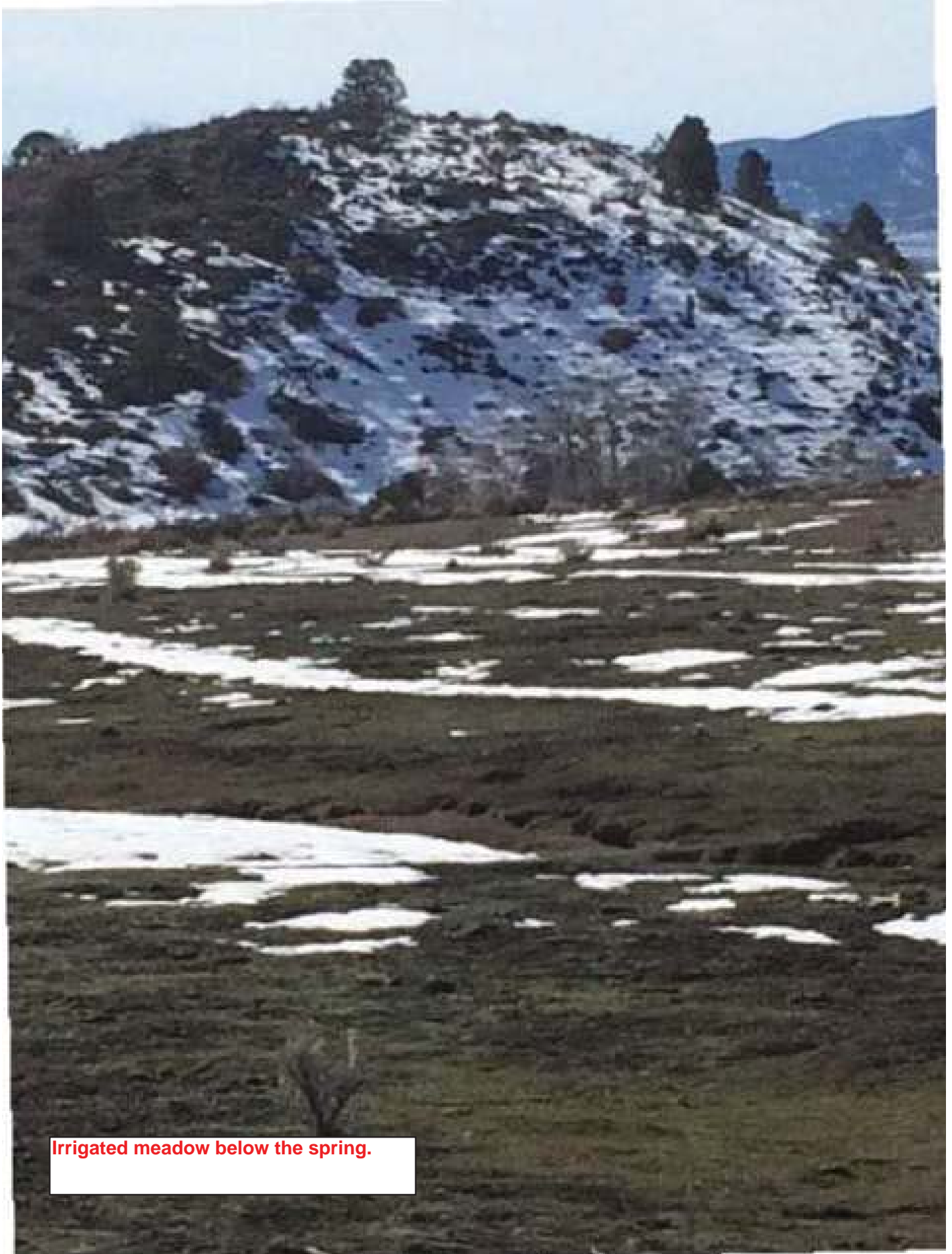
Irrigated meadow below the spring.