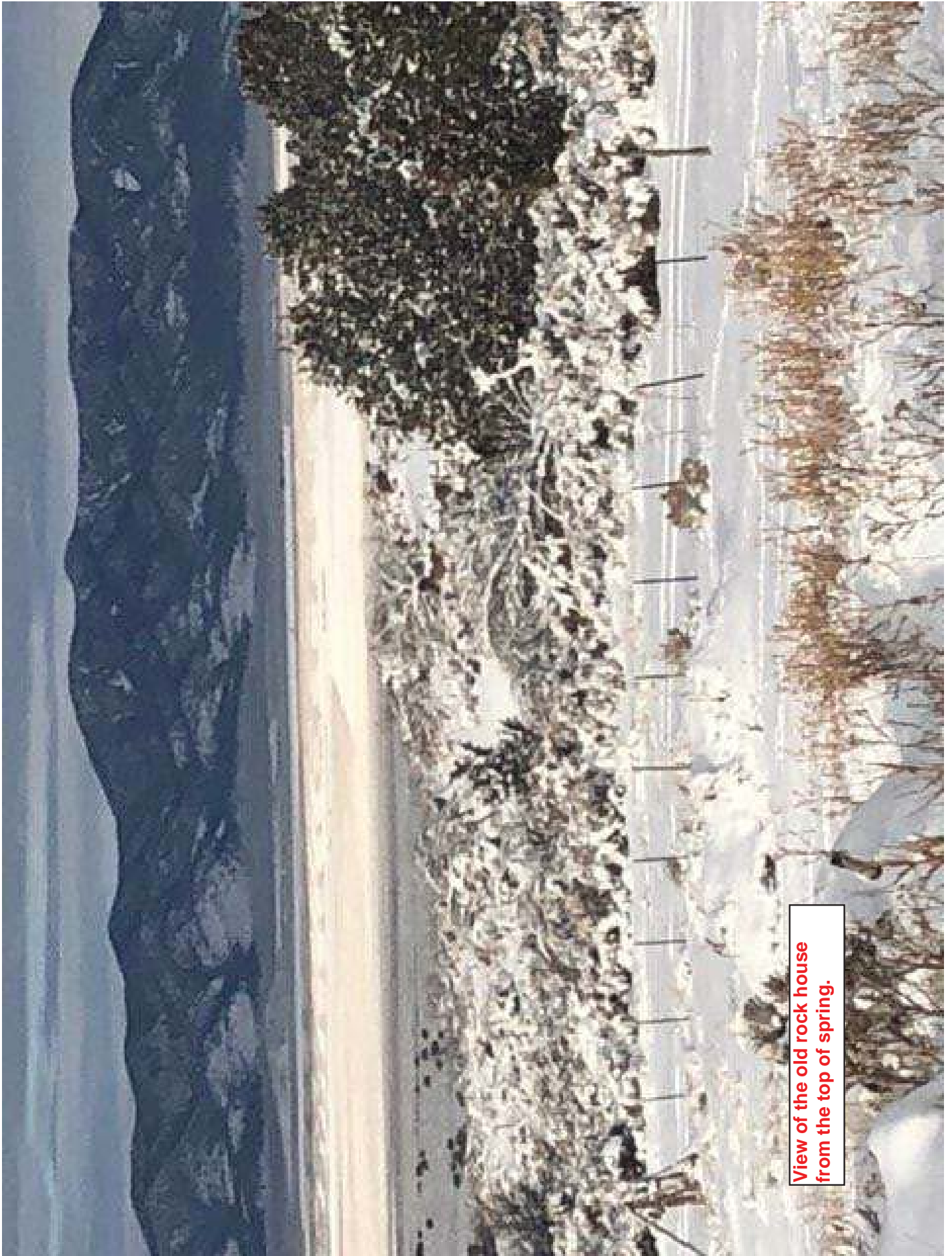
View of the old rock house from the top of spring.