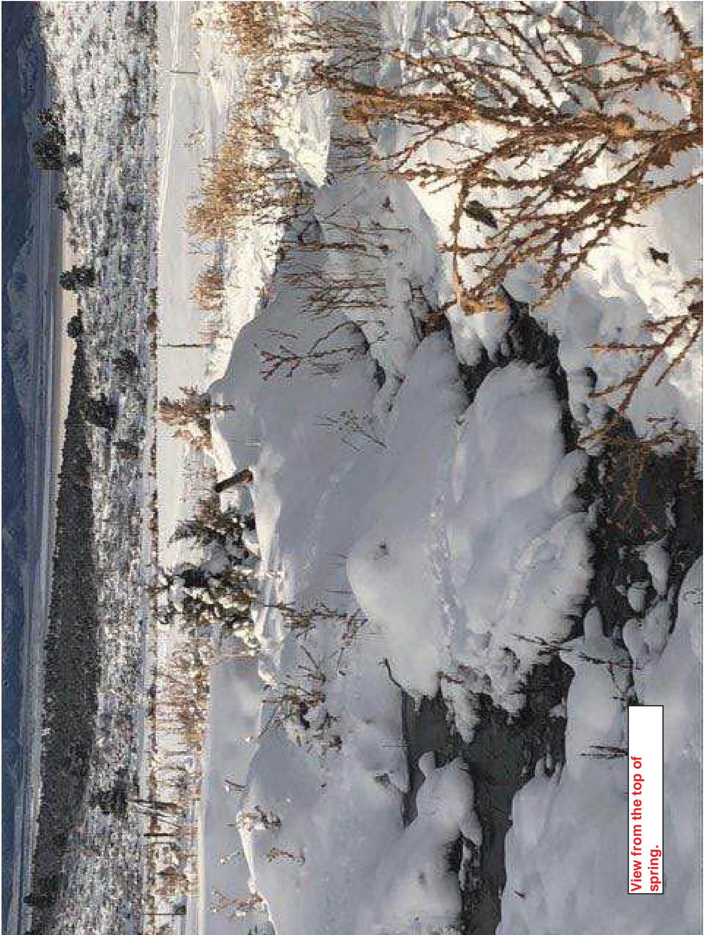
View from the top of spring.