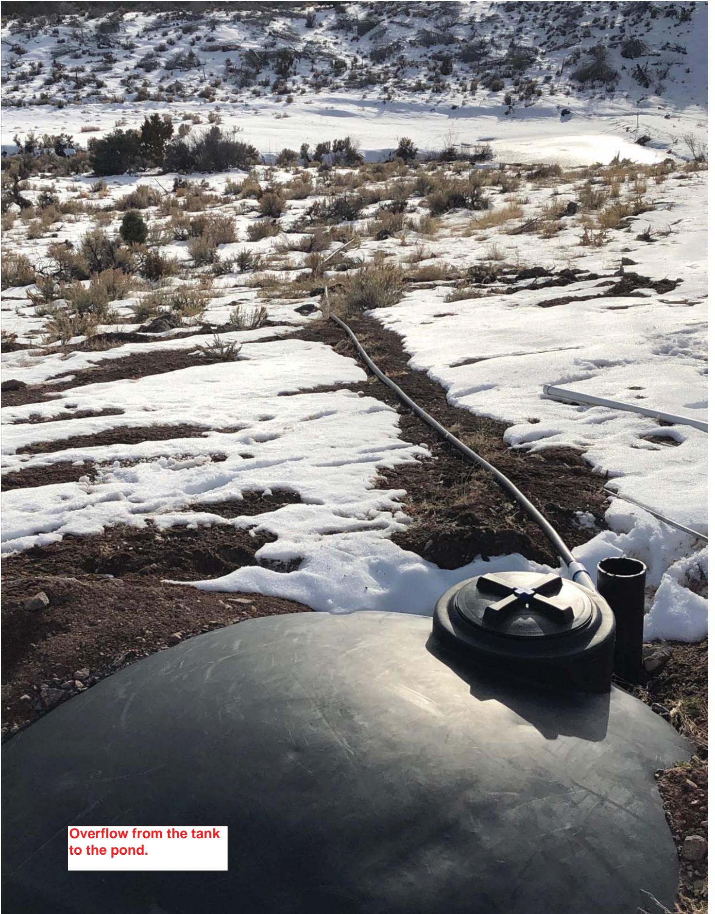
Overflow from the tank to the pond.