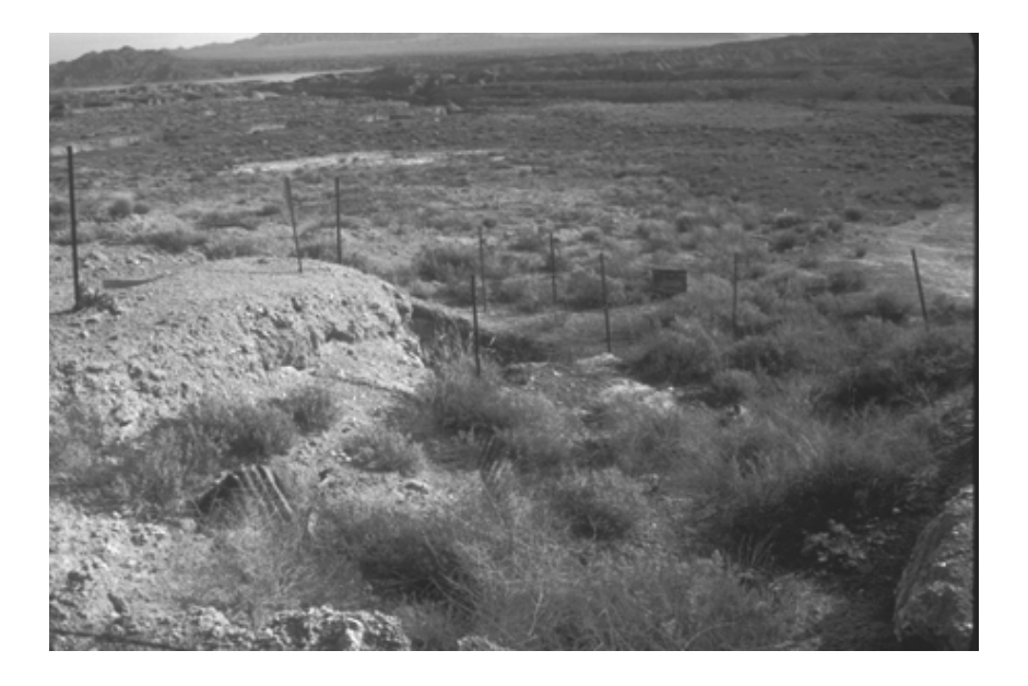
Figure 3. Gotchell Spring at Lake Mead NRA where flows have terminated and upland vegetation grows in spring outflow channel.

area. Figure 3 shows a spring area that no longer supports a wetland because of flow termination.