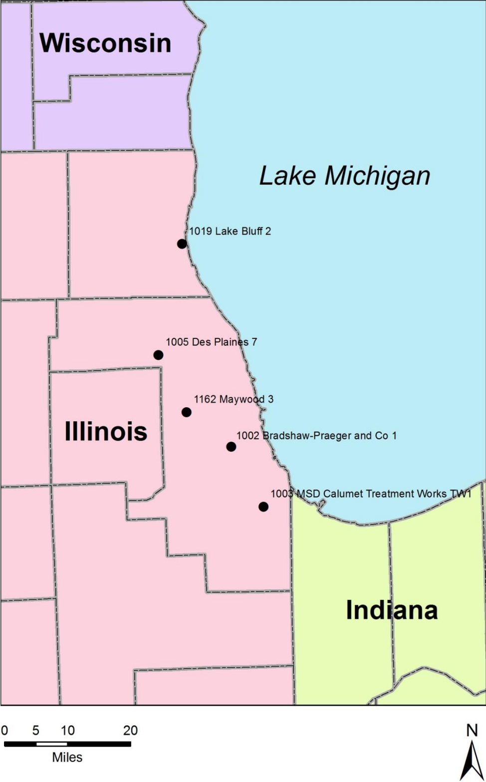
Figure 1 Hydrograph locations.