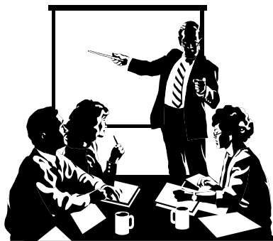
Flood Workshops Planned to Help Communities with Mitigation Efforts