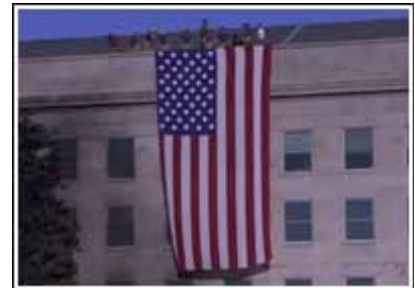
Arlington, VA, September 12, 2001— Firefighters unfurl the flag over the side of the Pentagon near the crash site.